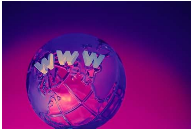
Figure 1. Figure captions are indented 5 spaces and justified. If you are familiar with Word styles, you can insert a field code called Seq figure which automatically numbers your figures.

Figures are centered. Use or insert .jpg, .tiff, or .gif illustrations instead of PowerPoint or graphic constructions. Captions go below figures. Indent 5 spaces from left margin and justify.